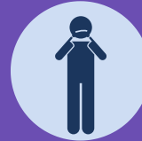
swollen lymph nodes